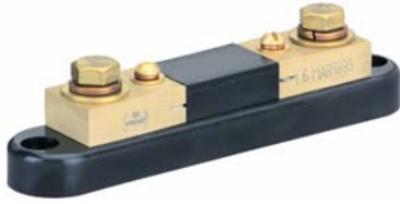
50mV Shunts Portable 150 amp Catalog No. 06714