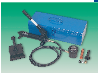
Box: H = 150, W = 570, D = 230