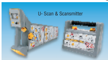
U-Scan & Scansmitter