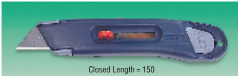
Closed Length = 150