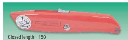
Closed length = 150