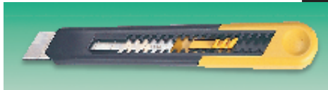
610-057 – 130mm Closed 610-069 – 165mm Closed