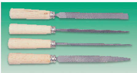
Blade length = 106, overall length = 172