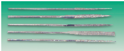
Blade length = 50, Overall length = 140, Shaft dia. = 2.9