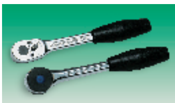
10.5° ratchet 6° ratchet