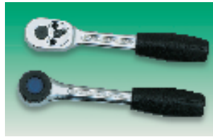
12° ratchet 6° ratchet