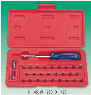
H = 45, W = 250, D = 120