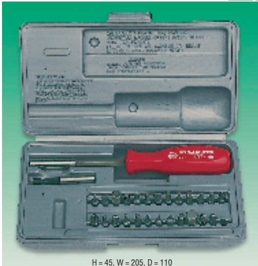
H = 45, W = 205, D = 110