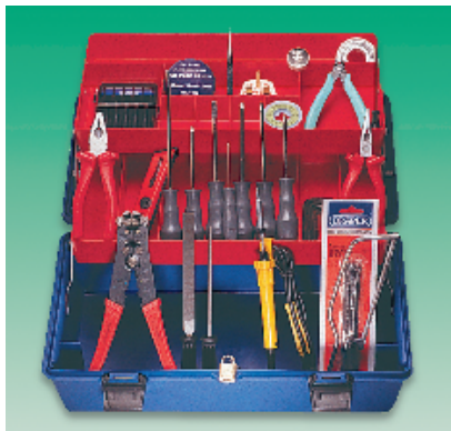
H = 230, W = 460, D = 250

Note: Tool case contents subject to design change.