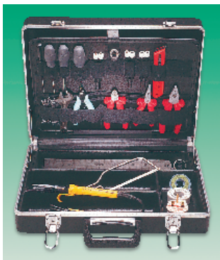
H = 121, W = 419, D = 305

Note: Tool case and contents may be subject to minor substitutions to ensure availability.