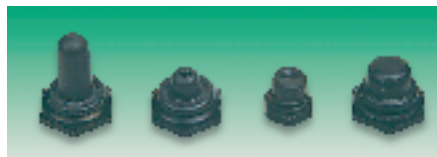
Covered toggle seal 150-212 Protruding toggle seal 150-213 Push button seals 150-214 150-215