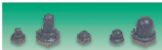
Covered toggle seals Protruding toggle seals Push button seals