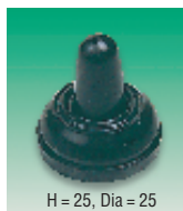
H = 25, Dia = 25