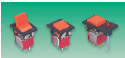
Switch fitted with lever actuator and plain bezel Switch fitted with rocker actuator and plain bezel Switch fitted with button actuator and bezel with LED

Body dimensions Single pole: H = 12.7, W = 6.86, D = 8.89 Double pole: H = 12.7, W = 11.43, D = 8.89 Bezel: without LED = 15.62 19.43 2.29 with LED = 15.62 27.94 2.29 Panel cut-out: 15.24 12.7 (LED hole 8.71 \varnothing , 13.21 centres)