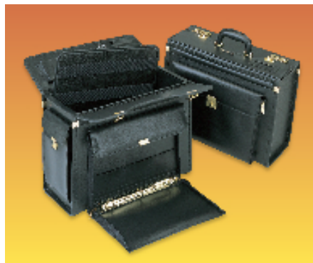
Case: Internal dimensions H = 305, W = 190, D = 420 Tool board: H = 300, W = 400, D = 30