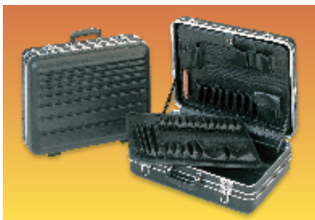
H = 200, W = 495, D = 390 Weight (empty) 5kg