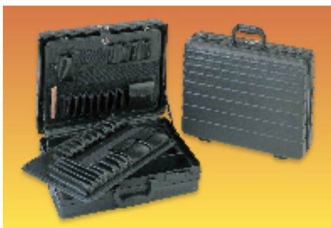
109-254 H = 170, W = 490, D = 380 Weight (empty) 4.7kg