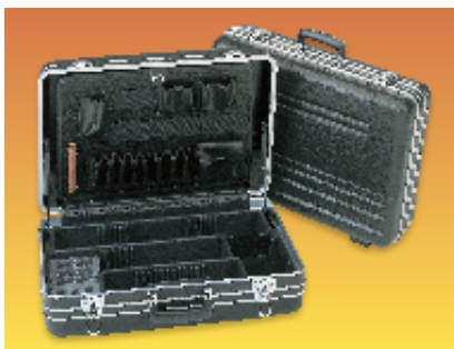
H = 175, W = 550, D = 390 Weight (empty) 5kg