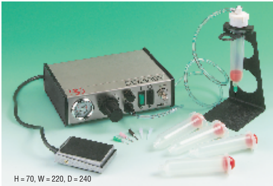
H = 70, W = 220, D = 240