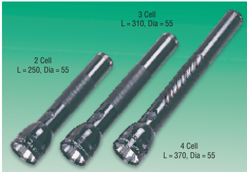
2 Cell L = 250, Dia = 55