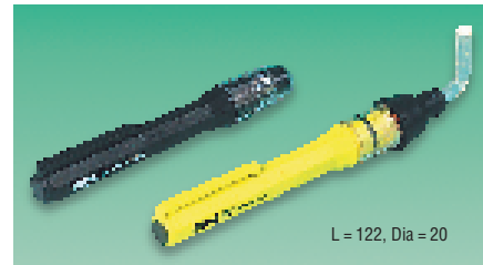
L = 122, Dia = 20