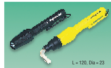
L = 120, Dia = 23