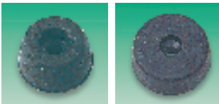
Type 1 Type 2