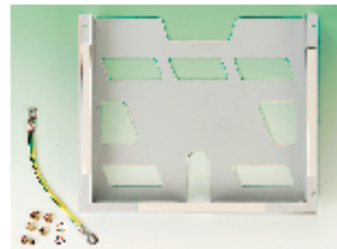
Earth Strap Kit Length = 170 Diagram Pocket A4: H = 234, W = 278, D = 40 A5: H = 174, W = 188, D = 22