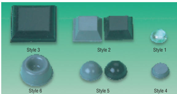
Style 3 Style 2 Style 1 Style 6 Style 5 Style 4