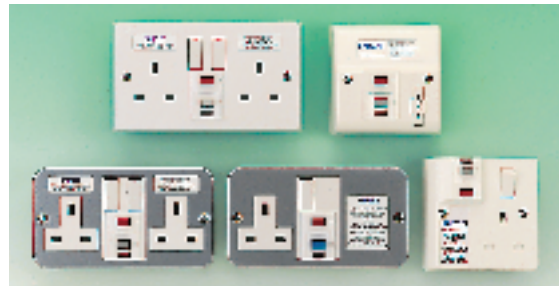
Metal Clad - 2 Gang Plate H = 76, W = 136, D = 47