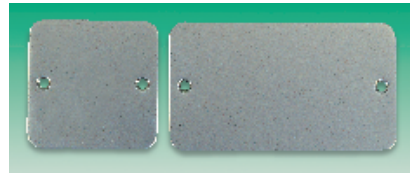
H = 81, W (1 Gang) = 81, (2 Gang) = 142, Fixing centres (1 Gang) = 60.3, (2 Gang) = 120.6