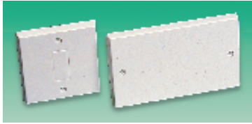
H = 86, W (1 Gang) = 86, (2 Gang) = 146 Fixing centres (1 Gang) = 60.3, (2 Gang) = 120.6