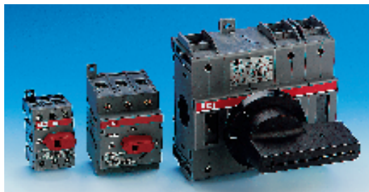
ABB Control Limited