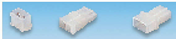
PCB header PCB hole dia = 1.8 Socket housing Pin housing