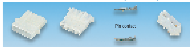
Pin housing Socket housing Socket contact PCB pin header PCB mounting centres 4 1.78 dia, 5.08 (0.2") Pitch

A four way power connector that mates with most popular 5 1/4" and 3" standard disk drive units. To facilitate extension cable to be made up, a four way PCB mounting header is also available.