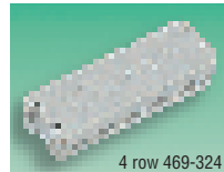
4 row 469-324